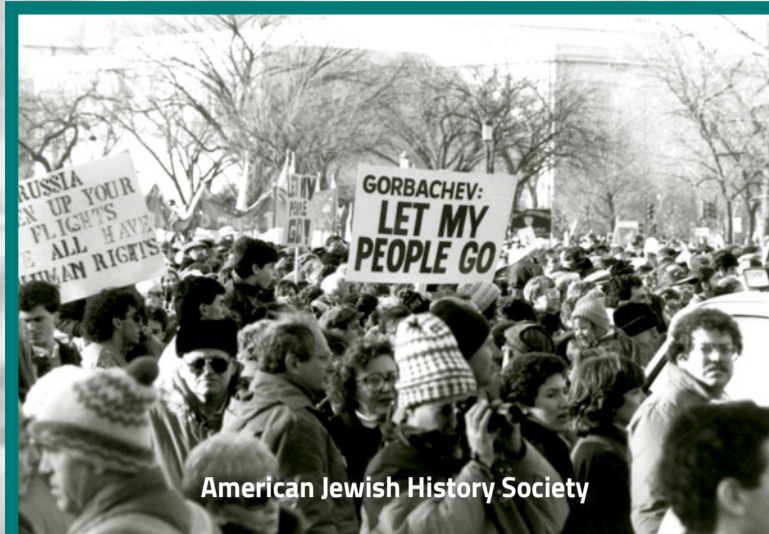
American Jewish History Society