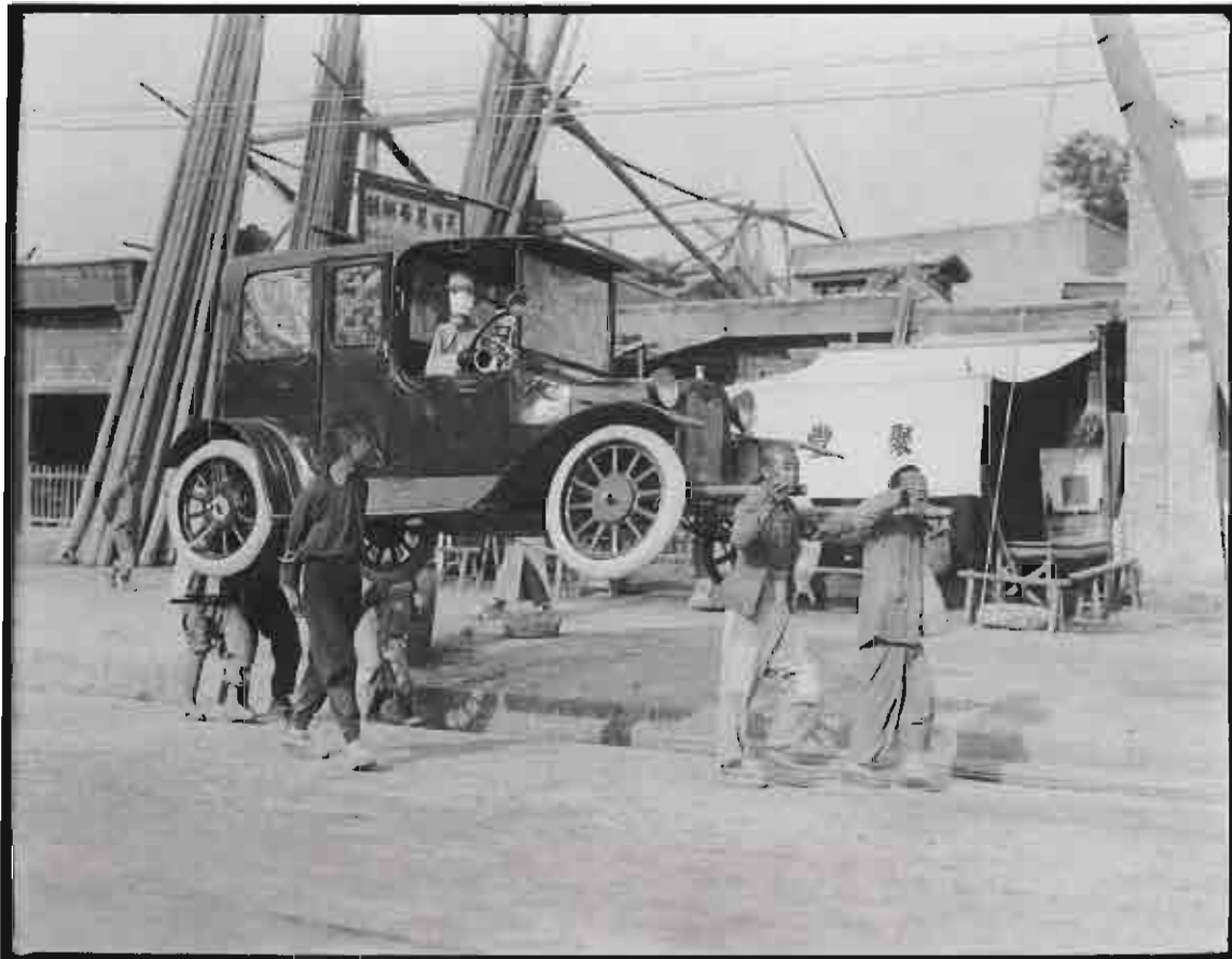
“Carrying a [paper] funeral car,” [item 395-2266, photograph taken between 1924-1927]